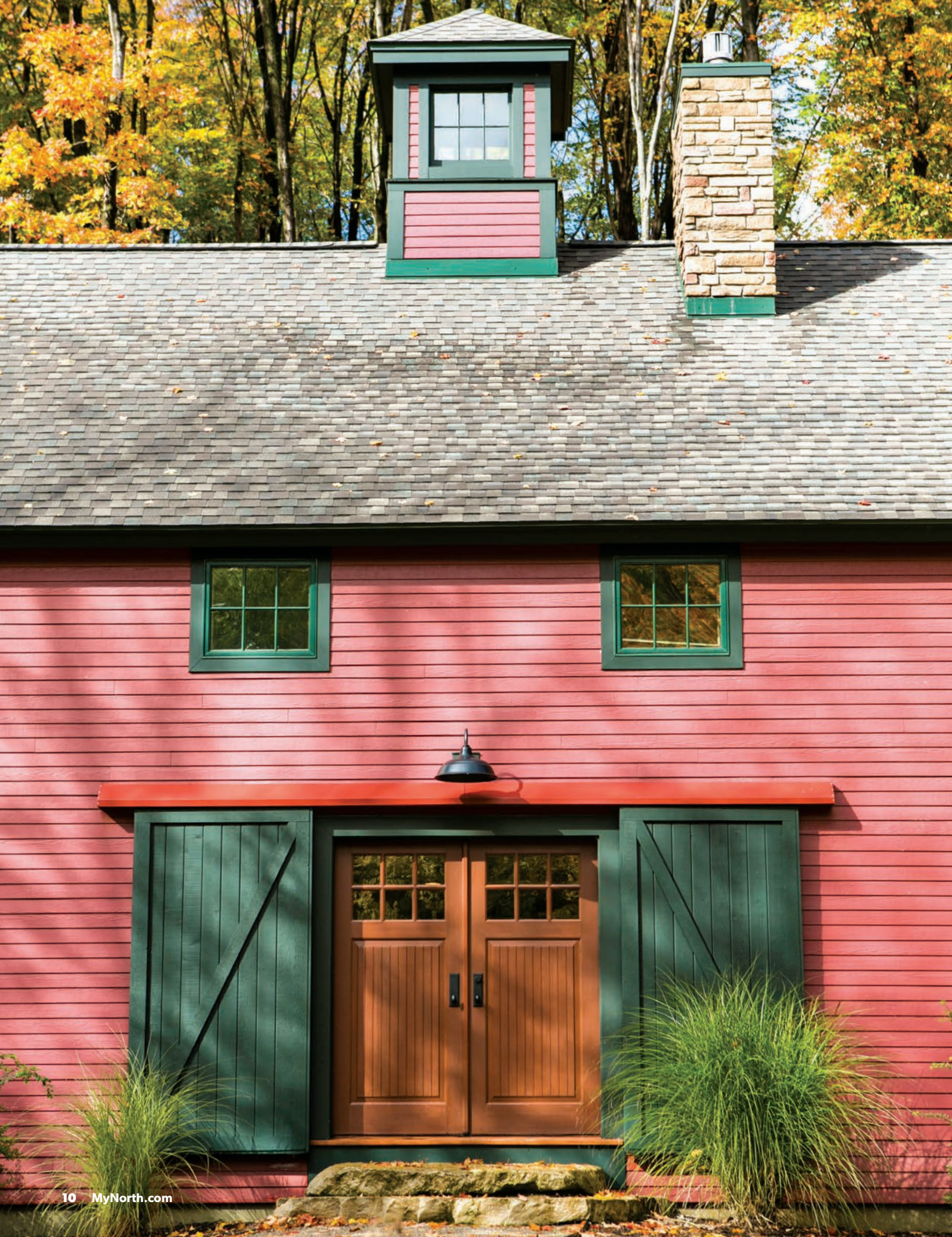
Opposite: The home's front entrance exudes classic barn style with a symmetrical arrangement of a cupola, six-light windows, and a set of functional barn doors. Below: With a double-height ceiling and a tall bank of windows, the living room is light and spacious.